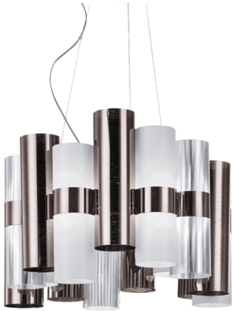
LA LOLLO MEDIUM - PEWTER/WHITE